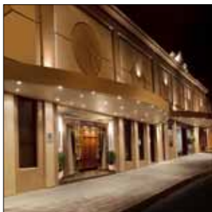
CONCA D'ORO Riverwood 02 9153 9932 concadoro.com.au